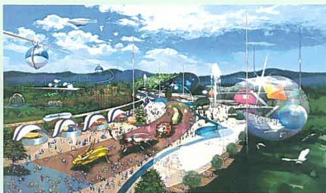
Rendition of the Global Loop