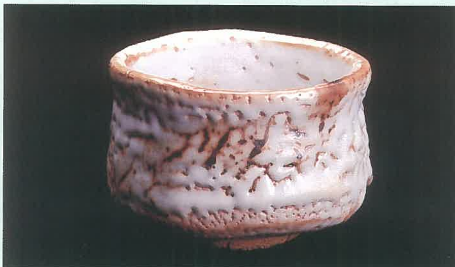
artwork made by one of the Amano Ceramic Art Club members

Aichi Prefecture is known for its ceramic ware, and ceramic ware produced in Seto City and Tokoname City is particularly famous. Incidentally, several nationally important large scale construction projects are underway near the two cities. One of the projects is the "EXPO 2005 AICHI," which will be held from March 25, 2005 to September 25, 2005 near Seto City with the theme, "Nature's Wisdom." The other project is the "Chubu International Airport," which is under construction at full pitch at an offshore site near Tokoname City, with the aim of opening in March 2005. Amano Enzyme Inc. is supporting both projects.